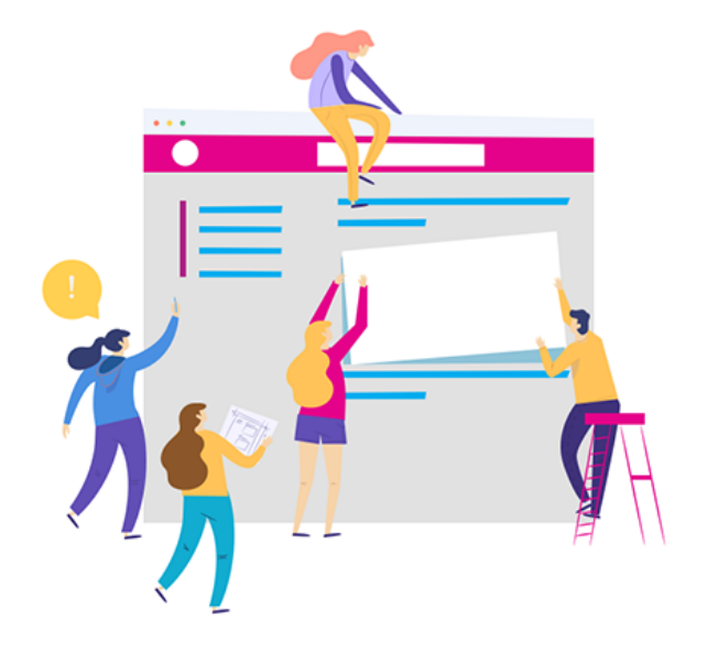
We'll help you build your intranet

During this time, you will have guided sessions with our onboarding team, who will help you get your intranet ready to be used by your wider community. You can use these hours however you wish, and we'll track everything via a Google spreadsheet that we will share with you following our first call. (Please note that meetings, sessions, and implementation will be deducted from these hours.)